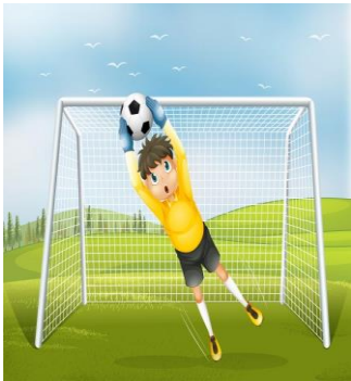
CATCH THE BALL