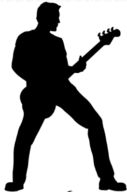
PLAY THE GUITAR