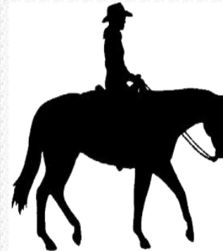
RIDE A HORSE